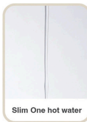
Slim One hot water

Patent application number: 10-2023-0085565 Hot Water Dispensing Structure